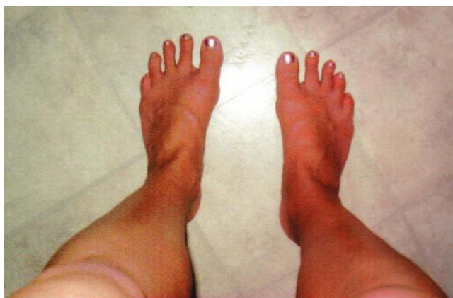
FIGURE 1. Redness and swelling in the lower extremities of our patient with erythromelalgia.

The initial MT assessment showed limited active and passive range of motion of the extremities because of hypertonicity in the muscles. The patient monitored her pain and discomfort using a pain scale of 0–10 (0 = no pain, 10 = extreme pain) (8) . On initial assessment, the patient reported pain in the distal extremities as 8 bilaterally. She indicated experiencing more pain in the evening, peaking at night before bed, and she described experiencing painful symptoms of erythromelalgia approximately 3–4 days each week, with episodes lasting between 24 and 72 hours. She described the characteristics of the pain in the lower extremities as a cramping pressure, and she provided a photograph of the distal extremities showing redness and swelling as a result of erythromelalgia (Figure 1). Aggravating factors for the patient included extreme