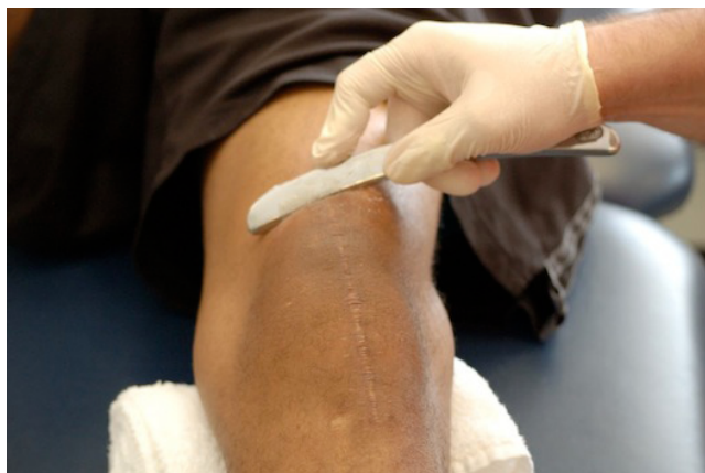
FIGURE 4. Graston technique: instrument application to the distal quadriceps and suprapatellar pouch. The patient actively extends and flexes the knee during treatment to augment soft-tissue release.

(5-cm diameter) under the left knee. For the next 3 visits, GT scanning was performed with the patient passive on the plinth, while adhesion-specific treatment was performed with the patient moving his knee, activating underlying musculature, or performing functional activities—for example, closed-chain terminal knee extensions (TKEs), mini-squats. During the scanning process at visit 3, it was felt that the more superficial adhesions were resolving well and that the deeper structures would be better addressed with activation or function. Activities performed after the GT were chosen with intent to support fascial and scar release and to improve volitional control of the quadriceps and other SFL musculature of the LE.