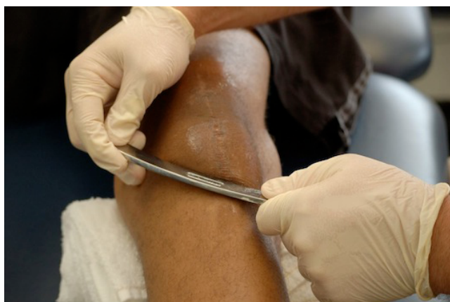
FIGURE 3. Graston technique: instrument application to the patellar tendon and surgical incision site.

For the first 2 visits, the GT was applied with the patient supine or long-sitting with a small towel roll