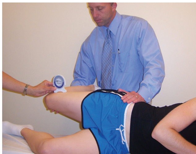
FIGURE 3. Ober's test.

After the physical exam was completed, each athlete ran on a treadmill, 0% grade, at her normal running speed until she experienced knee pain sufficient to make her stop running. She was then asked to rate her pain on a numeric scale (NPS) of zero to ten (zero representing no pain and ten representing unbearable pain) just before she stopped running (Table 1). The athletes each filled out a pain diagram illustrating exactly where they were experiencing the pain.