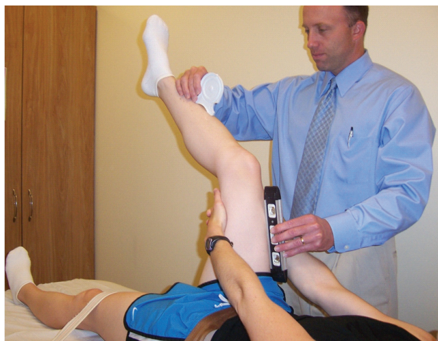
FIGURE 2. Measuring knee extension angle (KEA).

The KEA and the Ober's tests were measured with a bubble inclinometer (Table 1). The KEA was performed as described by Gajdosik (30,32) (Figure 2). The patient was positioned supine on the exam table with one mobilization belt placed across the anterior superior iliac spines and another across the mid-thigh of the left lower extremity. The patient was asked to bring her right thigh toward her chest and support it with both hands clasped behind the knee. The examiner placed a level along the patient's anterior thigh to ensure that the leg was perpendicular to the table. (In the study performed by Gajdosik, a wooden dowel was used to block the subject's thigh to keep the leg perpendicular to the table). A bubble inclinometer was placed on the patient's shin and she was asked to actively straighten her lower leg. The measurement was taken at the end of the range of active knee extension, which is the degree of knee flexion from terminal knee extension. The intratester reliability of the KEA test has been reported to be .99 (30,32,33) . A KEA angle of 20° has been defined as a cutoff score indicating hamstring muscle tightness (34) . Therefore, a KEA angle of greater than 20° indicates hamstring tightness; three of the four athletes exceeded the threshold for hamstring tightness.