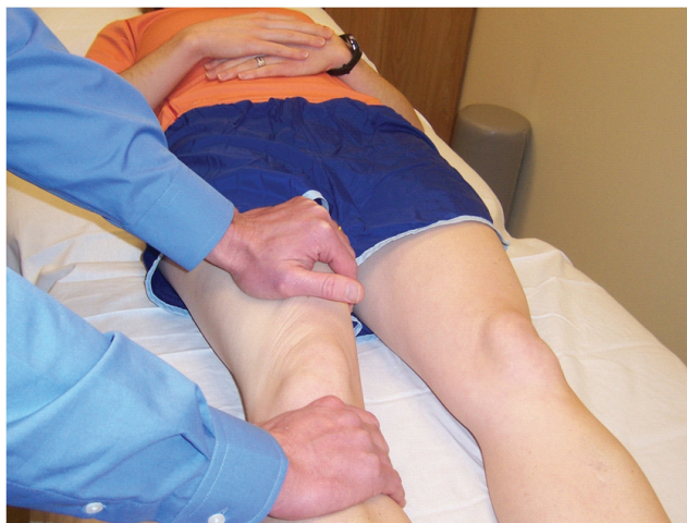
FIGURE 5. Muscle bending the vastus lateralis.

At four weeks, three of the athletes were able to run on the treadmill, 0% grade, at their running speed, for three miles without having to stop due to lateral knee pain. All three athletes stated that they could continue past three miles; however, the test was stopped due