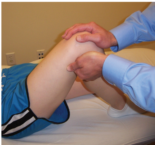
FIGURE 4. Stroking the anterior border of the ITB.

The patient remained supine while muscle bending (20) of the vastus lateralis was performed (Figure 5). The author's right hand grasped the proximal tibia and knee joint. The left-hand palm was placed over the vastus lateralis. Firmly grasping the proximal